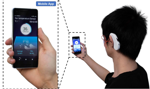
Figure 1: In-Ear Thermometer can monitor the core body temperature by sensing the inside of the auricle.

surface temperature is easily affected by the environment. Moreover, these solutions are not suitable for a long-term and unobtrusive application. As a result, a continuous and wearable core body thermometer is demanded.